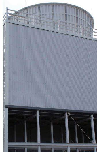
Fiber Reinforced Plastic (FRP) Works