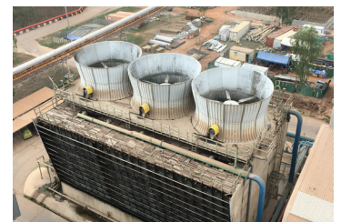
Removal of Mechanical Parts and Repairs To Structural Members