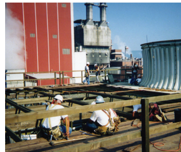
Preparation of Fan Deck Area